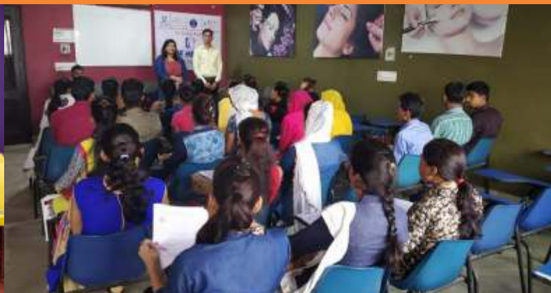
MESC team at Nsfed-Skill Development Training Programme