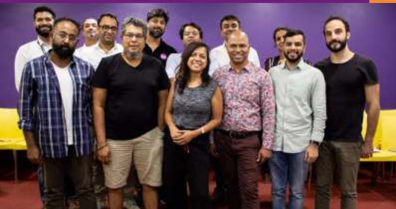
MESC team along with TSM