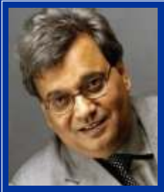
Shri. Subhash Ghai

Chairman (MESC) Renowned Indian Film Director, Producer & Screenwriter