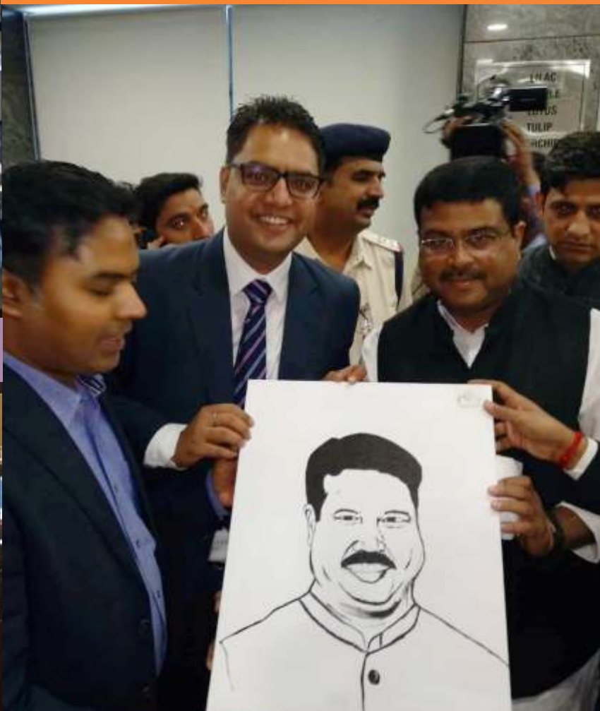
Shri. Dharmendra Pradhan, being presented a sketch by MESC team