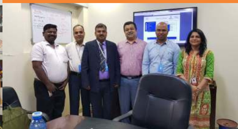
MESC team in discussion with the officials of DIGC