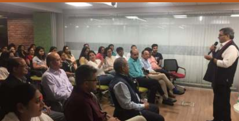
Mr. Subhash Ghai, Chairman, MESC addressing the team at NSDC