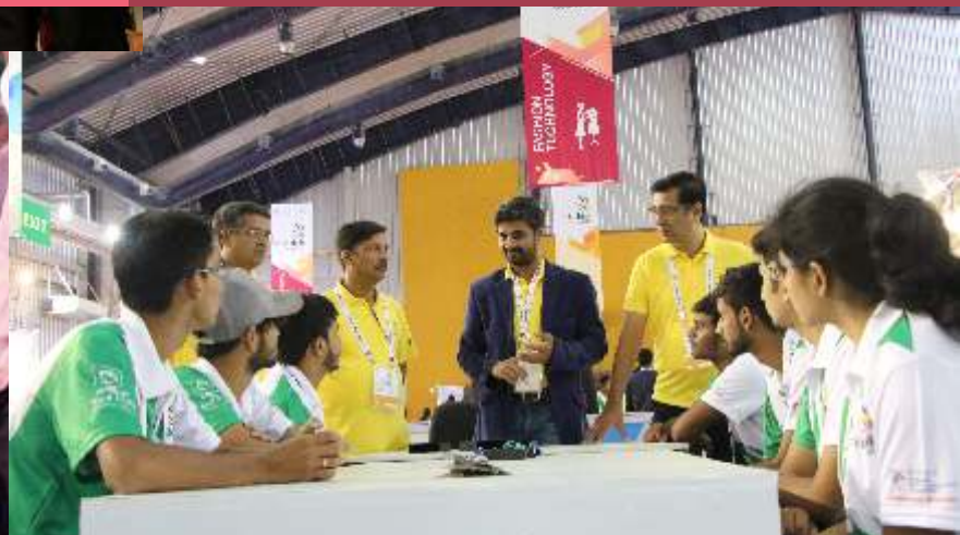
Jury with Print Media Technology Competitors