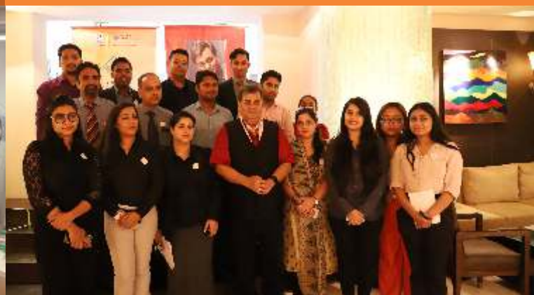
Mr. Subhash Ghai, Chairman, MESC interacting with MESC team