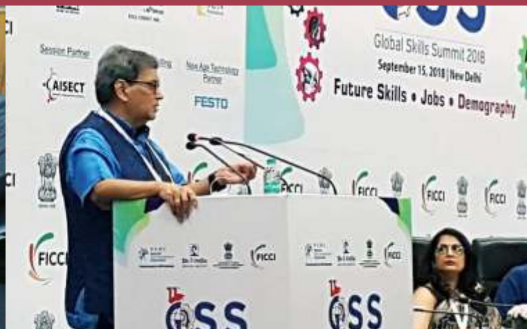
Subhash Ghai, Chairman, MESC at Global Skills Summit 2018.