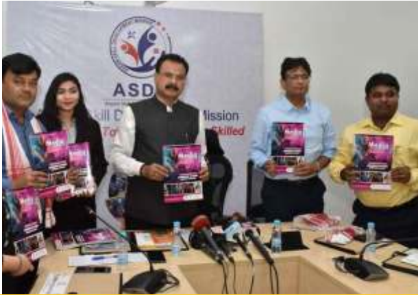
Media Talkback 7th Edition with special focus on North East

Honorable Minister Shri. Chandra Mohan Patowary, releasing the 7th Edition of Media Talk Back magazine showcasing North-East as the Gateway to ASEAN Countries