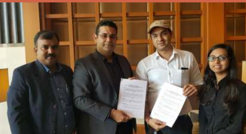
MESC signed MoU with Artistize