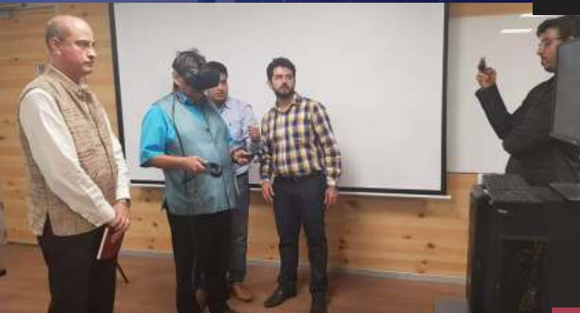
Mr. Subhash Ghai, Chairman, MESC participating wearing the VR and exploring the future skills in the M&E sector at the NSDC