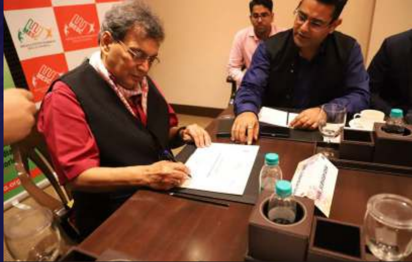
Mr. Subhash Ghai, Chairman, MESC signing his first Certificate of Industry Partner for the Council