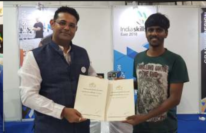
MESC signed MoU with Kayatech & Robotech