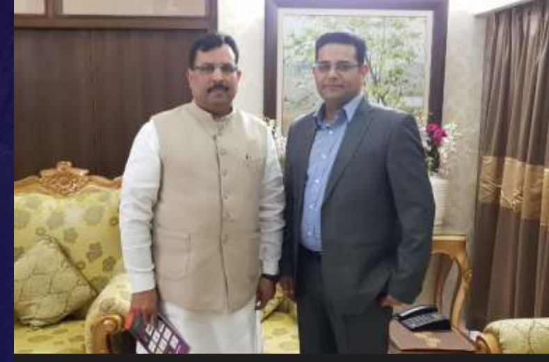
MESC team in discussion with Captain Abhimanyu, Cabinet Minister, Govt of Haryana.