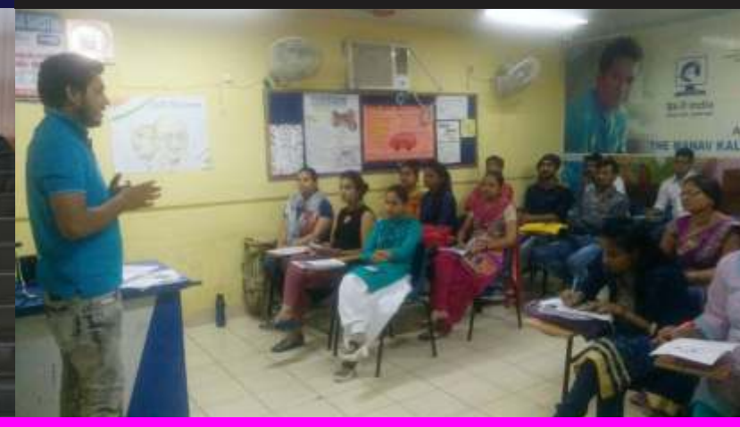
Training of Trainer program organized by MESC in Delhi