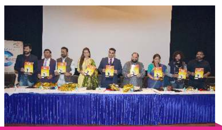
Released 5th Edition of MESC Magazine

Media Talk Back, 5th Edition magazine of February 2018 on "Re-skilling the Training Ecosystem" released by Media & Entertainment Skills Council with the hands of Eminent Industry guests during Mind&Career Confluence 2018