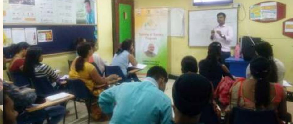
Training of Trainer program organized by MESC in Delhi