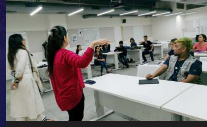
Worldskills Awareness Program organized by MESC at NIFT Delhi