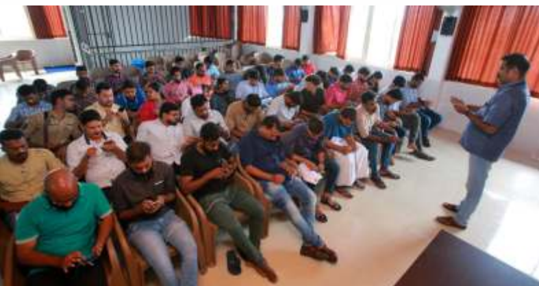
RPL assistment for Camera Operator (AKPA)