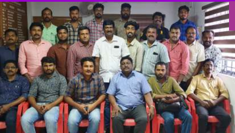
RPL assistment for Assistant Camerman (AKPA)