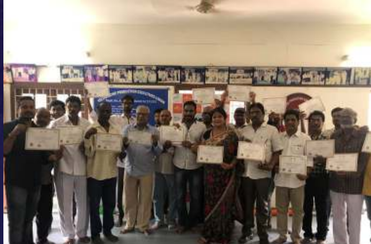
RPL certificate distribution ceremony