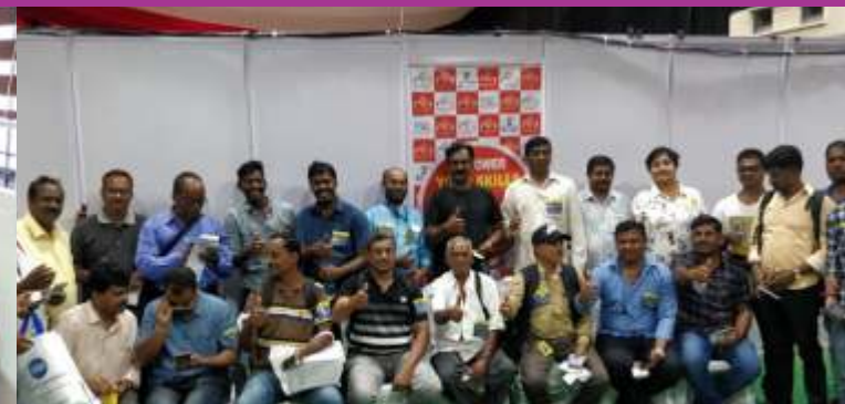
RPL assessment at KPA