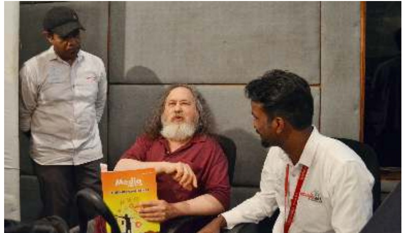
Richard Stallman, Activist & Programmer going through the Media Talk Back magazine.

The government has adopted a holistic approach to learning, which is a philosophy of education based on the premise that each person finds identity, meaning, and purpose in life through connections to the community.