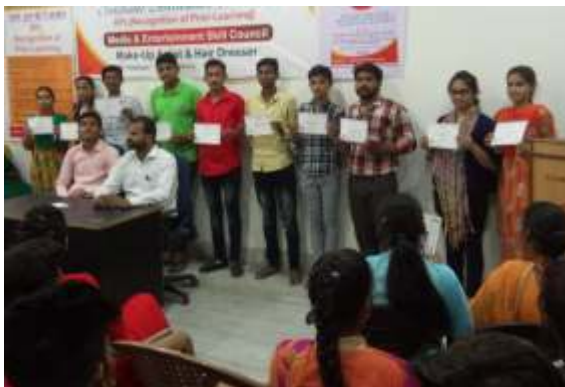
RPL Certificate Distribution ceremony of Salmani Khalifa Society

We are trying to expand and generate more employment this year. Rotomaker has worked on every major hollywood movie.