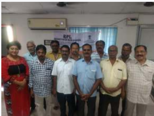
RPL Assessment for FEFSI, Chennai

Ans. RPL certification should be recognised by government bodies as a qualification for enrolment into opportunities with Public Media corporations or institutions, this would enable a truly skilled person to compete on par with a recognised Media school graduate.