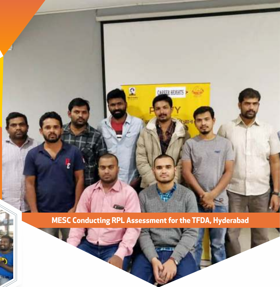
MESC Conducting RPL Assessment for the TFDA, Hyderabad