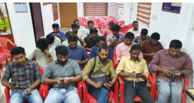
RPL assistment for Director of Photography (AKPA)