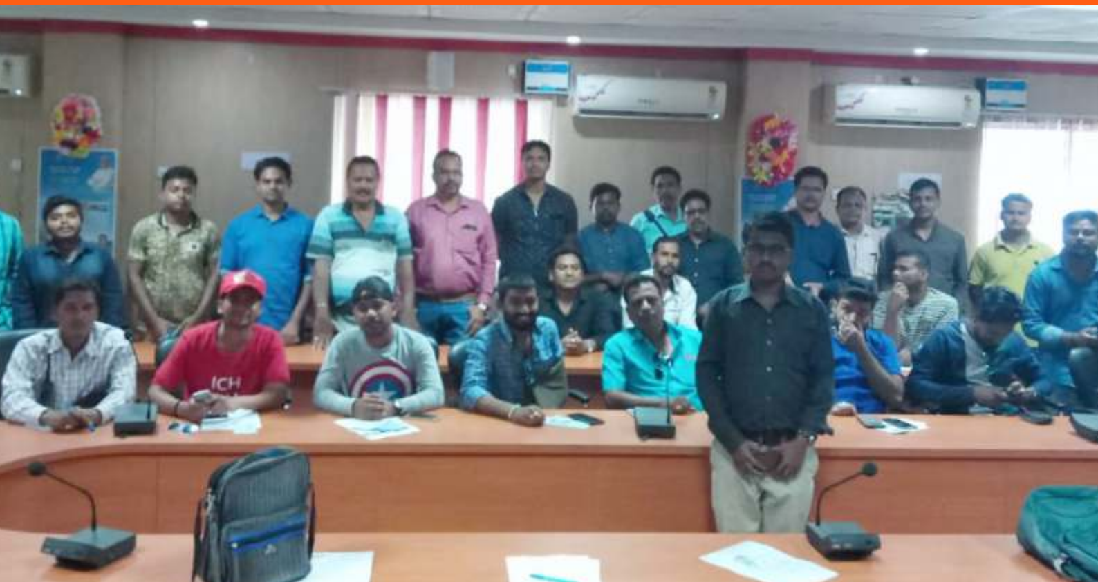
RPL assessment for Photographic Association of Odisha