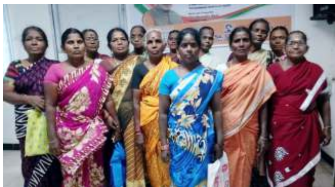
RPL assessment for Production Asst.

Ans. A person who is RPL certified can easily get a work permit in the foreign film industry thereby getting the experience and exposure which leads them to improving their skills in an efficient environment by being able to work and learn alongside the best in the industry.