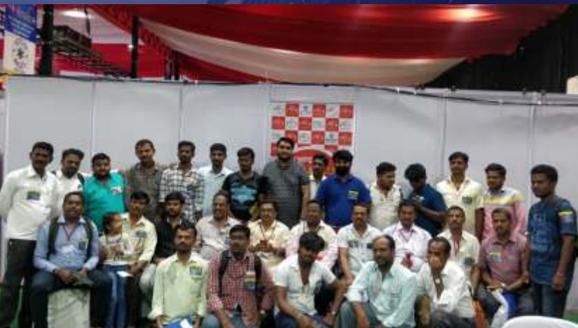
RPL assessment at KPA