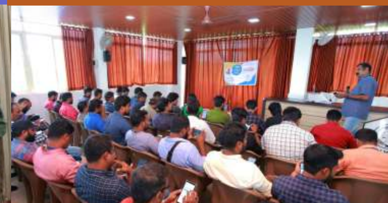
RPL assistment for Assistant Camerman (AKPA)