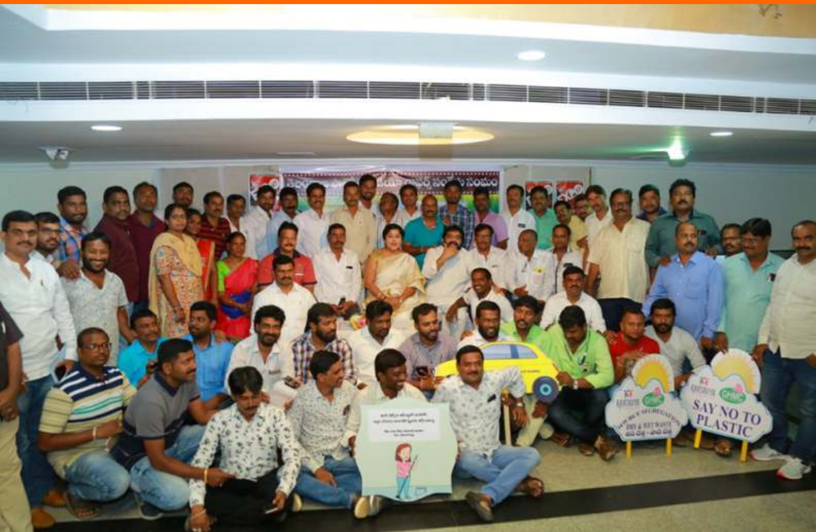
RPL orientation for TGVPA