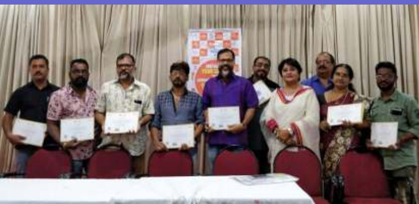
RPL certificate distribution ceremony