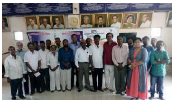
RPL assessment for Art Directors & Asst. Art Directors of FEFSI, Chennai