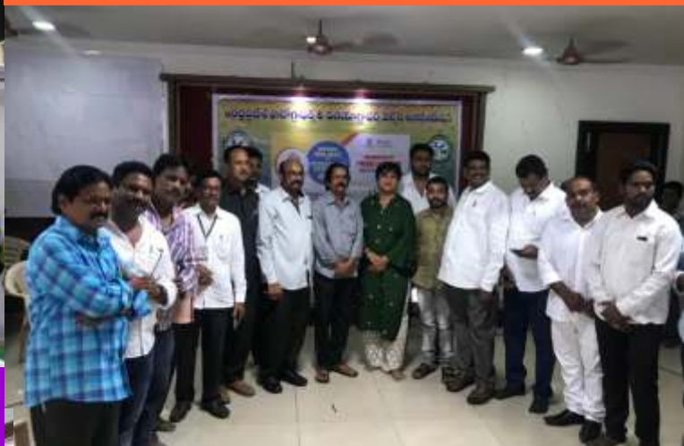
RPL assessment for APPVWA