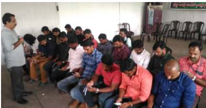
RPL assistment for Camera Operator (AKPA)