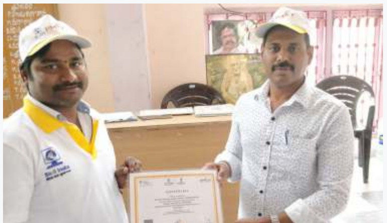
RPL Certificate distribution cere. HairStylist & Makeup Artist