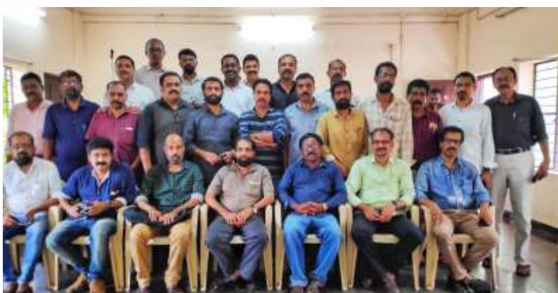
RPL assistment for Director of Photography (AKPA)