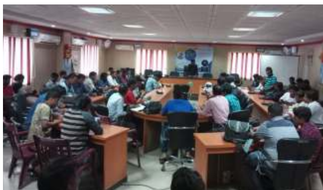
RPL assessment for Photographic Association of Odisha