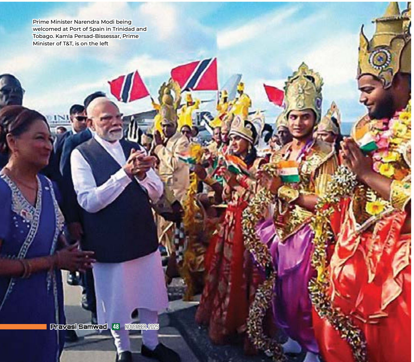
Prime Minister Narendra Modi being welcomed at Port of Spain in Trinidad and Tobago. Kamla Persad-Bissessar, Prime Minister of T&T, is on the left

“You are connected not just by blood or surname. You are connected by belonging. India welcomes, and India embraces you.”