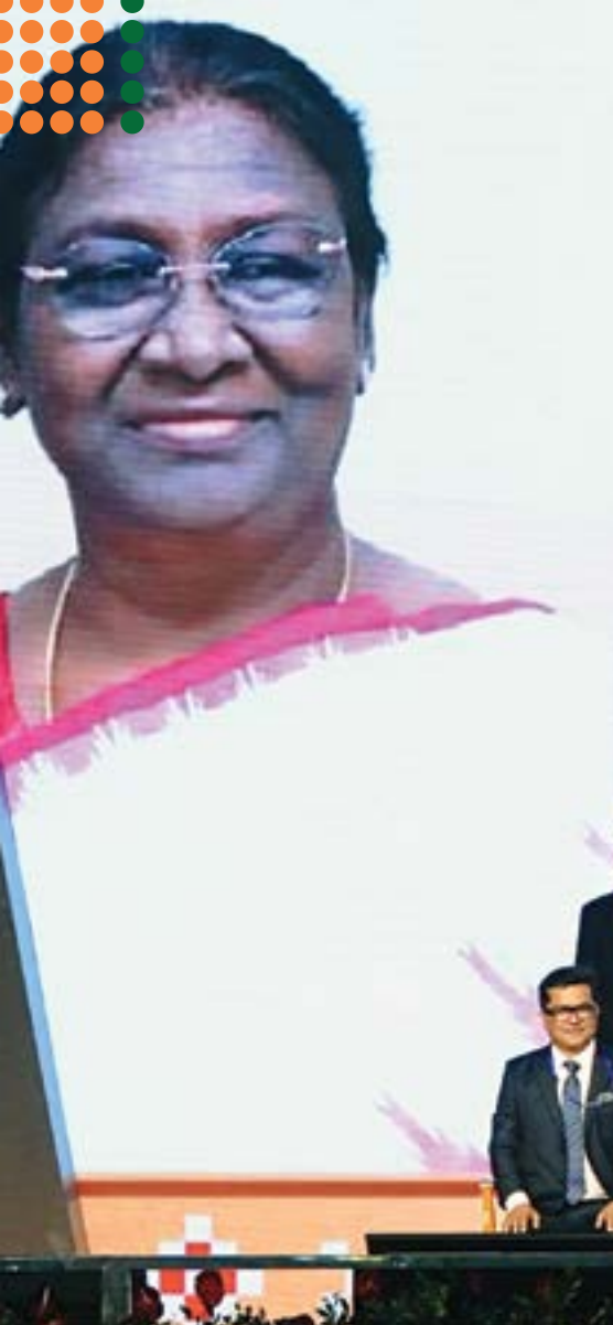
Smt. Droupadi Murmu President of India