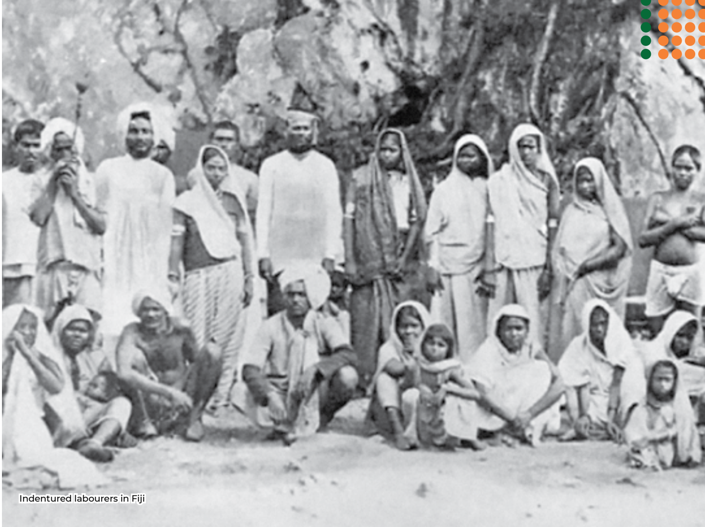
Indentured labourers in Fiji