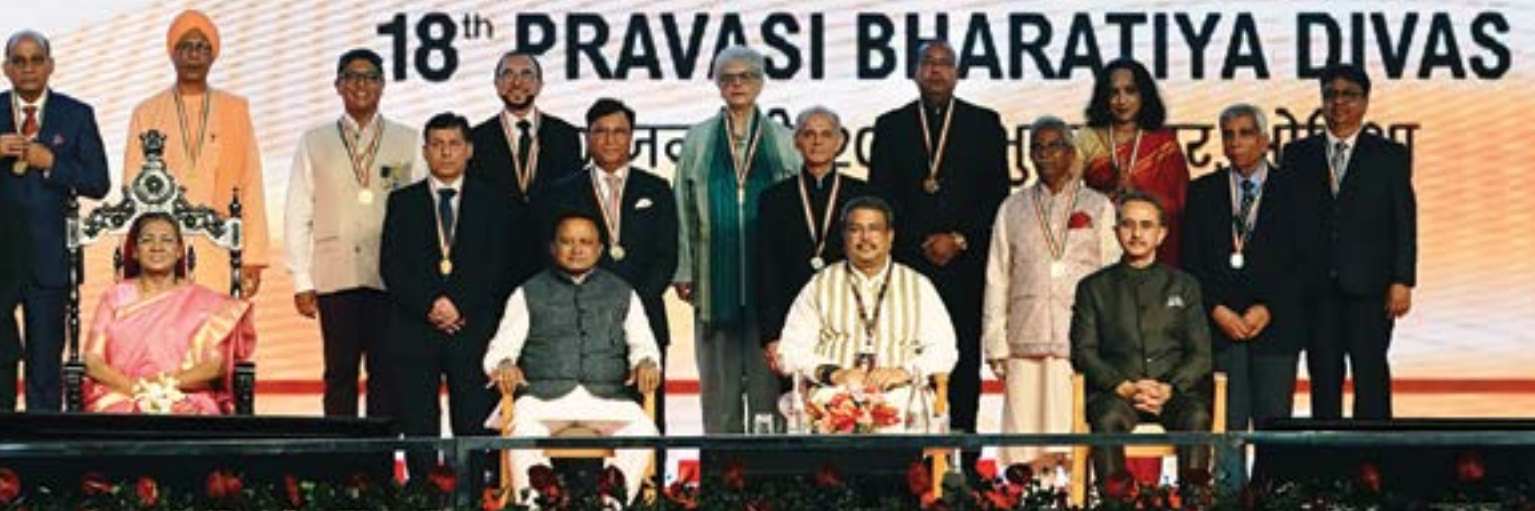
↑ Recipients of the Pravasi Bhartiya Samman Award 2025 with the President of India Smt. Droupadi Murmu and other dignitaries in Bhubaneswar, Odisha.