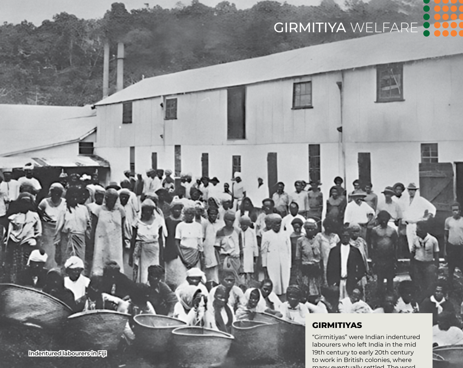
Indentured labourers in Fiji