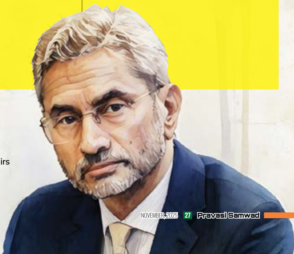
Dr S Jaishankar Minister of External Affairs

“The optimism and energy of youth are on display in Odisha—in its institutions of learning and in daily life.”